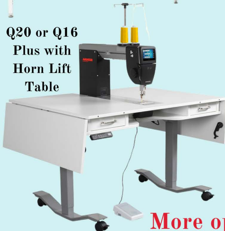
Q20 or Q16 Plus with Horn Lift Table