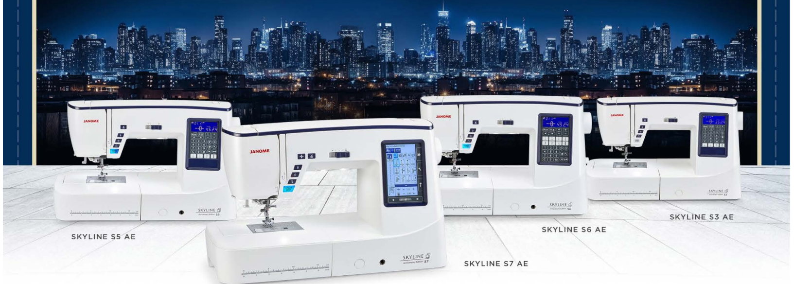
SKYLINE S5 AE